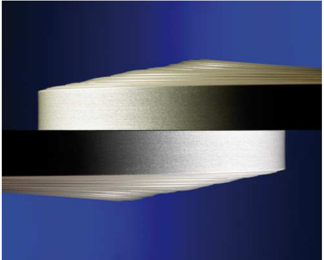
A perfect thermoplastic solution with the right metallic effect

The brushed metal effect is now achievable on standard PVC edges. Before only available on our 3D acrylic edge range. The brushed effect can also apply on solid color edges that give a unique finish. Great for contrast edges as well as for a color match. Contact your closest Doellken partner for a sample.